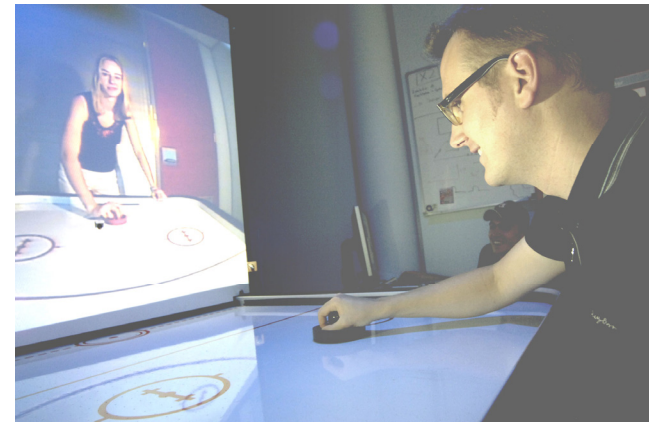
Figure 1. Airhockey Over a Distance.

floyd@floydmueller.com cole@lc.homedns.org shannon.obrien@csiro.au wouter.walmink@csiro.au