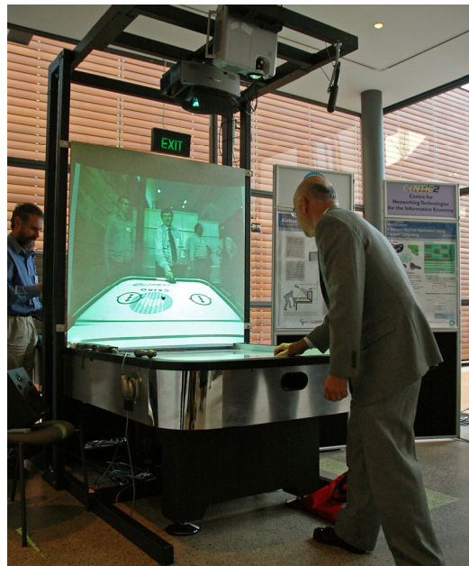
Figure 4. A participant playing Airhockey Over a Distance.

Participants were able to have a shared experience with the other players. An enthusiastic participant commented: "I'm taken with this... you could have a true interaction with someone, they could make you laugh, they could make you swear... that kind of interaction is unique, without abusing the word."